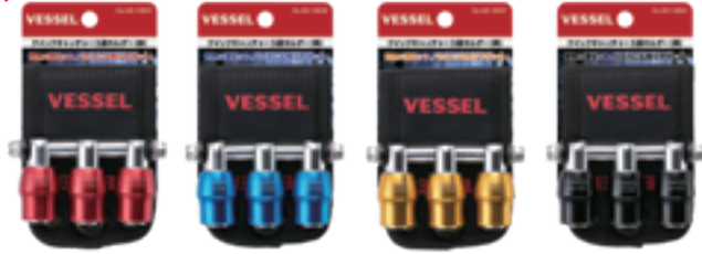
No.QB-10B3R No.QB-10B3B No.QB-10B3Y No.QB-10B3K