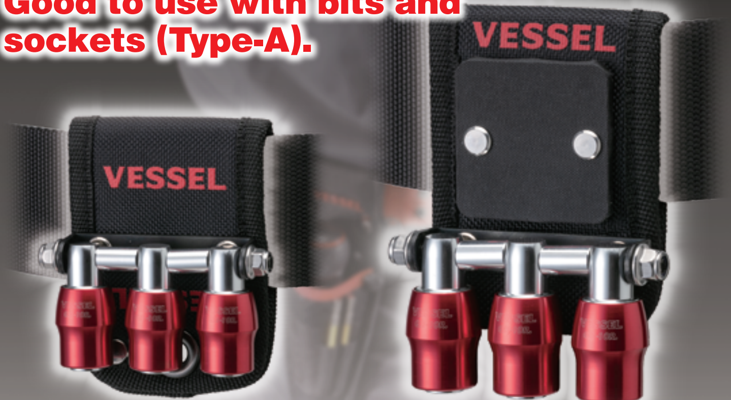
Quick Catcher Triple Holder QB-10B3 series

Set of 3 pieces in the same color. Good to use with bits and sockets (Type-A).