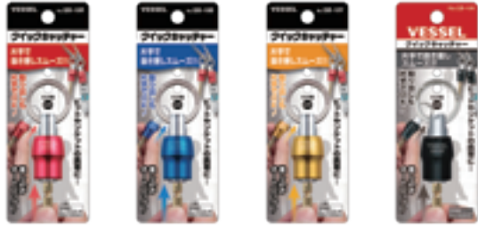
No.QB-10R No.QB-10B No.QB-10Y No.QB-10K