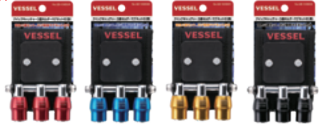
No.QB-10MB3R No.QB-10MB3B No.QB-10MB3Y No.QB-10MB3K